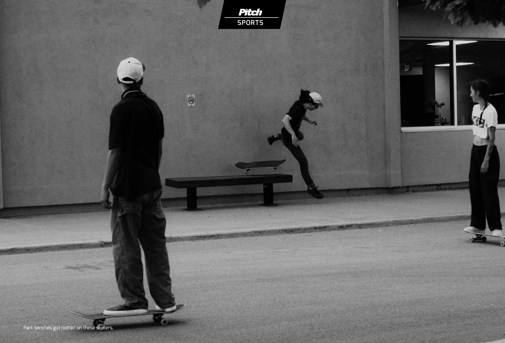
Park benches got nothin' on these skaters.